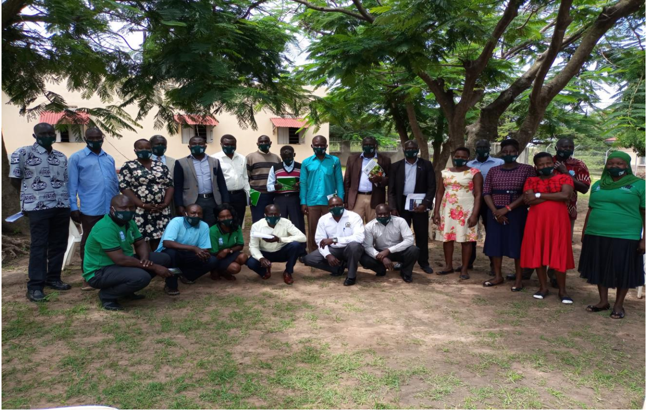
Group photo of the participants after the inception meeting in South Division Head quarter offices Koboko Municipality.